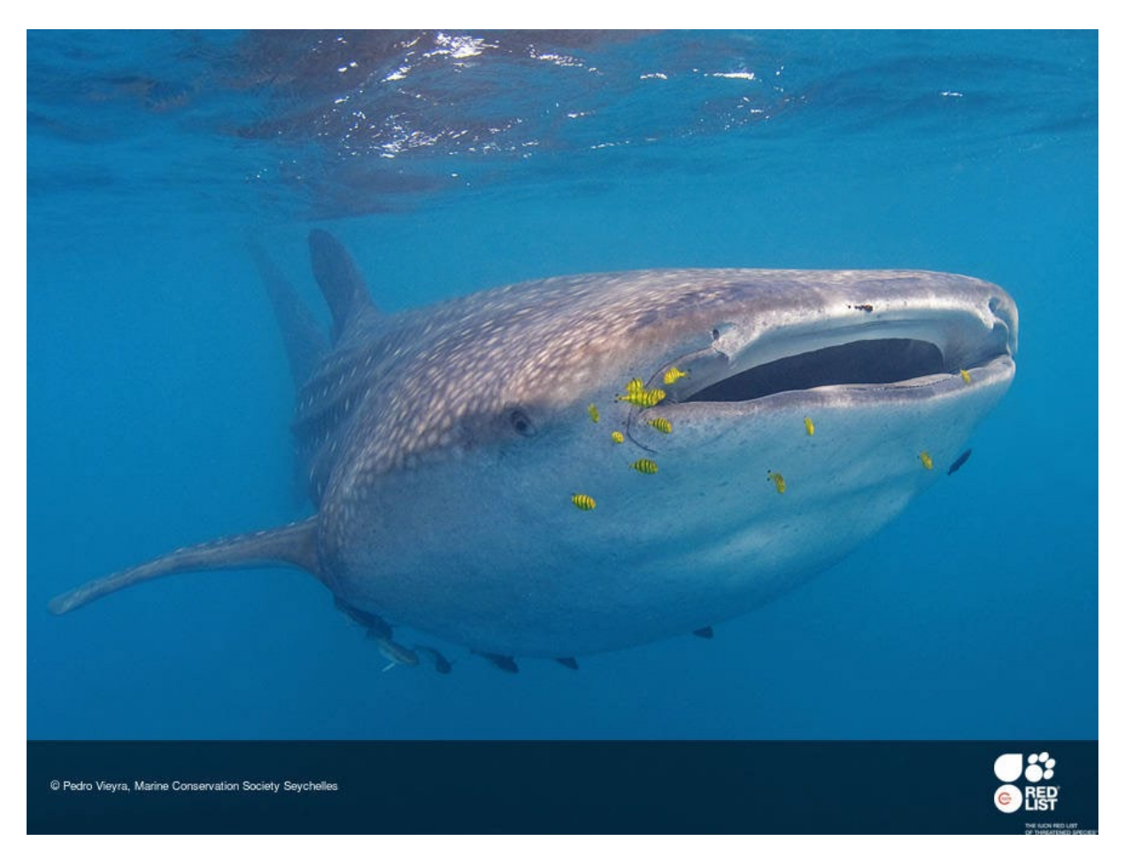
From IUCN redlist website: https://www.iucnredlist.org/species/19488/2365291

Proposal by the Republic of France and the Kingdom of Netherlands for the uplisting of the whale shark Rhincodon typus from Annex III to Annex II of the Protocol concerning Specially Protected Areas and Wildlife (SPAW Protocol).